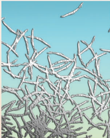
TPE in water dispersion; as water evaporates TPE film is formed