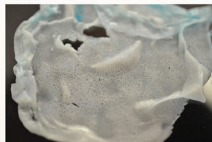
Cast film after 24 hours in water