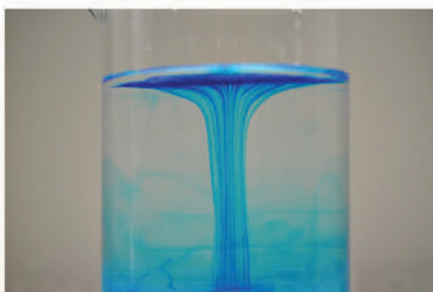
Film releases FD&C Blue #1 in water