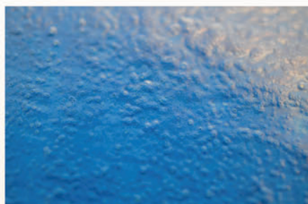
Cast film with FD&C Blue #1

62% NuLastic SILK-E ID-LSA 10 + 37% Polyderm PE-PA + 1% FD&C Blue #1