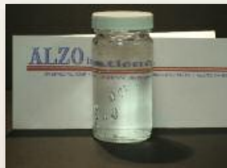
30% loading of hydrogenated polyisobutene in NuLastic SILK D5-6 gel (400,000 cps)